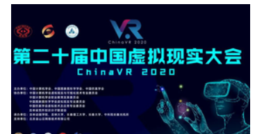
China VR 2020

In order to promote the communication of film and television majors between Chinese and foreign colleges and universities, and improve the creative level of teachers and students, 2020 International College Students Film& TV Exchange Exhibition Jilin,