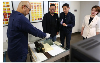
CCTV Interviewed JAI

on September 9, the CCTV News Studio interviewed Jilin Animation Institute. The one-hour live broadcast, led by reporters and teachers, came to a successful conclusion and was widely praised. During the live broadcast, the camera followed the reporter to the museum of JAI, stop-motion animation studio and other places, and introduced in detail the stop-motion animation production process, 3D animation production process, film and television special effects production, physical special effects production and other related content. JAI has been committed to the cultivation of high-end applied professionals in the cultural and creative industry, creatively practicing the talent cultivation mode of "Teaching-led, Scientific Research Supported and Industry-oriented", and has provided more than 40,000 applied talents for the national cultural and creative industry. In recent years, the good news of JAI has spread frequently and appeared internationally. The excellent short animation work "10,000 Ugly Inkblots" was shortlisted for the 2020 Annecy International Animation Film Festival in France and the Ottawa International Animation Festival in Canada. Experimental animation "Colorful Life" was shortlisted in the 2020 Los Angeles Asian Film Festival, injecting "Chinese Elements" into the international animation market and film and television industry. ( More Information ).